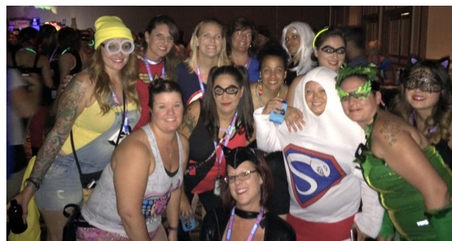
RollerCon 2015 Riedell Super Heroes vs. Super Villains Party!

All in all it was a good, hard-hitting bout. Congratulations to SCR D on a well-deserved victory. But, you can be sure FFF will be back, so look out!